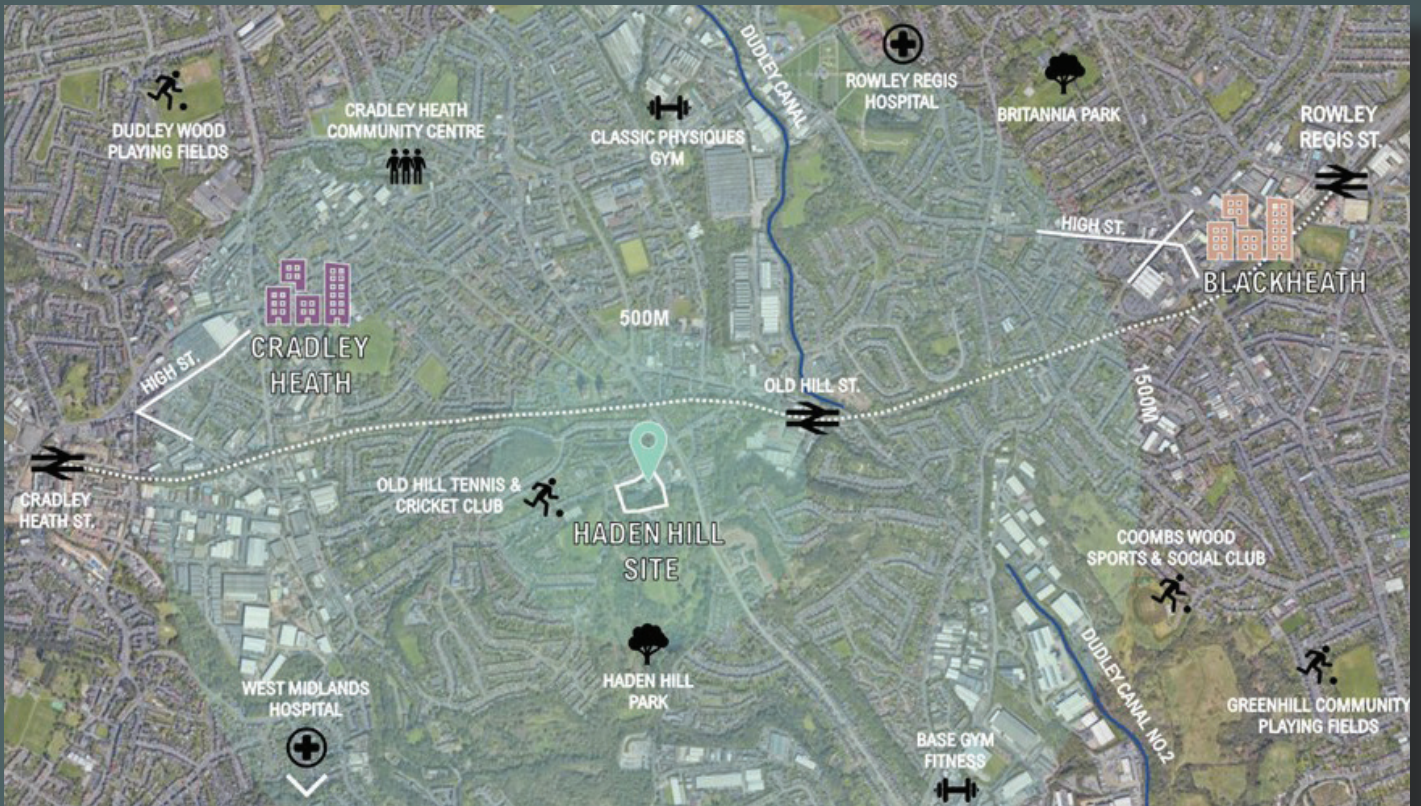
Map showing the location of the new leisure centre and the location of key facilities in Cradley Heath