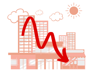
Declining town centres